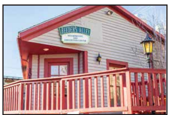
CONFERENCE CENTER EXTERIOR

Includes 6-foot banquet tables, high-top tables, folding chairs, wooden spool tables, 10 x 10 canopy tents, and lawn games.