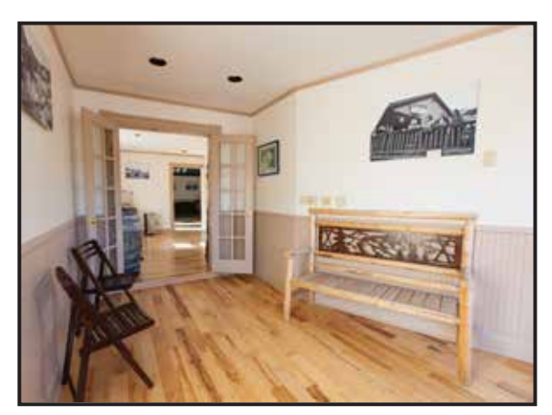
CONFERENCE CENTER FOYER

Note: If the pavilion is not in use during your event, you are also welcome to use the outlets in the pavilion shed, if needed.